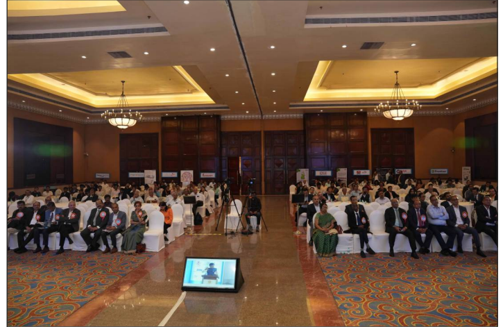
The Distinguished Audience

There was active interaction between speakers and delegates during the question-and-answer sessions as well as informal discussions during tea and lunch breaks, enabling meaningful exchange of ideas and effective dissemination of insights aligned with the conference theme.